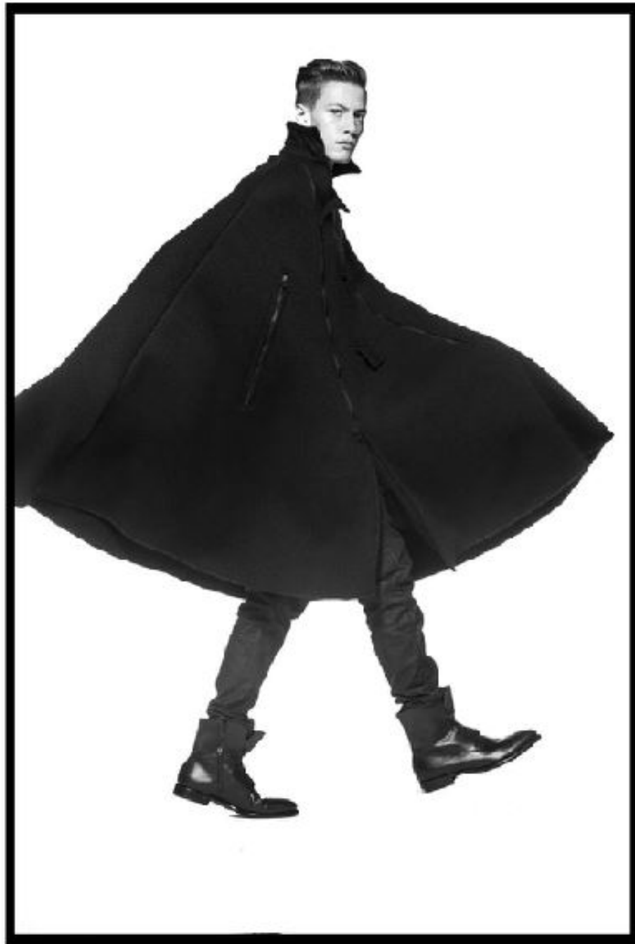
Max - cappa in lana MESSAGERIE - Jeans skinny VIVIENNE WESTWOOD - Anfibio ALBERTO GJARDIANI